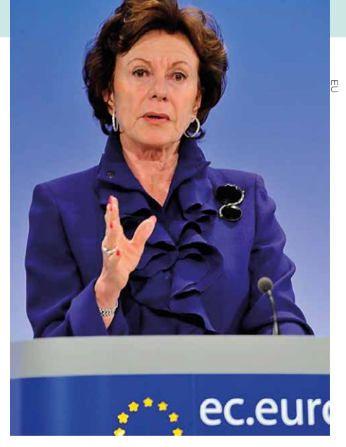
Neelie Kroes: We need to think seriously about whether the EU has sufficient powers to defend media pluralism

The policy aims of the media pluralism initiative are: