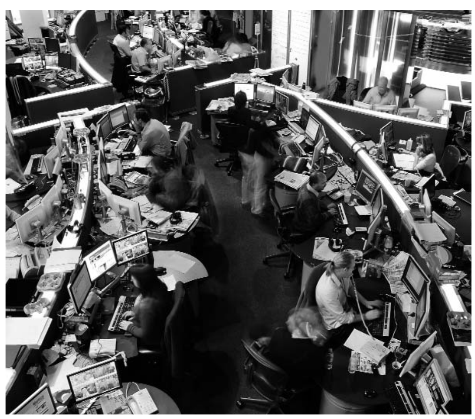
The Sky News newsroom: likely to fall under the Murdochs' complete control

customers, spending on average more than £500 a year each – nearly four times the BBC licence fee. Next year it is expected to register profits of £910 million on a turnover of £6.4 billion, which is four times that of ITV and half as much again as the BBC's.